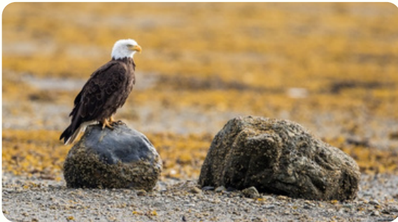
Banner and Bald Eagle

Under President Biden, industrial old-growth logging in the Tongass was largely halted in practice. The Southeast Alaska Sustainability Strategy took shape, shifting the region toward a conservation- and community-first vision. We worked tirelessly to make those protections durable, urging the administration to codify them through two key national rulemakings.