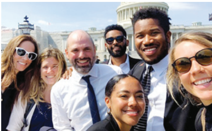
The North Face team with Alaska Wilderness League staff.