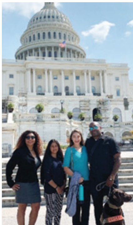
Soul River Inc. veterans and youth leaders in front of the Capitol in between lobby meetings.

A laska Wilderness League has a slogan of “Your Land. Your Voice.” We constantly work to empower our members, partners and advocates across the country to speak up on behalf of the lands and waters they care passionately about, and to elevate those voices in front of decision makers. These efforts were on full display the week of the House vote. Joining us in Washington, D.C., leaders from the Gwich’in Steering Committee and Gwich’in Steering Committee Youth Council, veterans, youth, faith leaders, outdoor industry partners and athletes advocated for the passage of H.R. 1146, The Arctic Cultural and Coastal Plain Protection Act. The Arctic Refuge encompasses issues from human rights to climate change; public land access to endangered species. Our ability to support and amplify voices representing all of these important aspects of the campaign