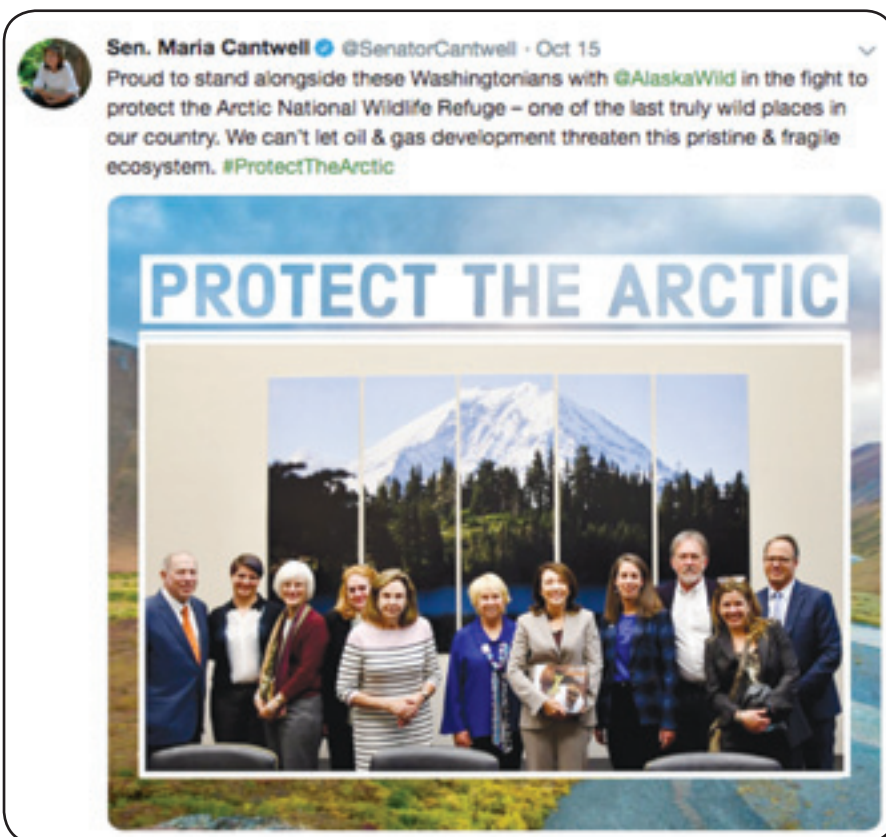
Senator Maria Cantwell (D-WA) tweeted this picture with our October fly-in team shortly after their meeting.

Watching so many new and passionate partners advocate on behalf of the Arctic Refuge for the first time was inspiring. Alaska Wilderness League remains committed to growing and supporting the voices of all those who care about Alaska's public lands and waters, human rights, climate change and endangered species. *