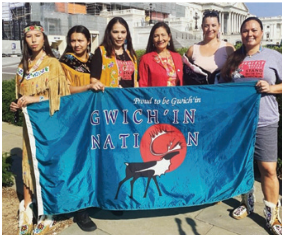
Gwich'in leaders and Representative Debra Haaland (D-NM) gather following a press conference calling for passage of H.R. 1146. Alaska Wilderness League

allows us to be highly effective in garnering support from Congress.