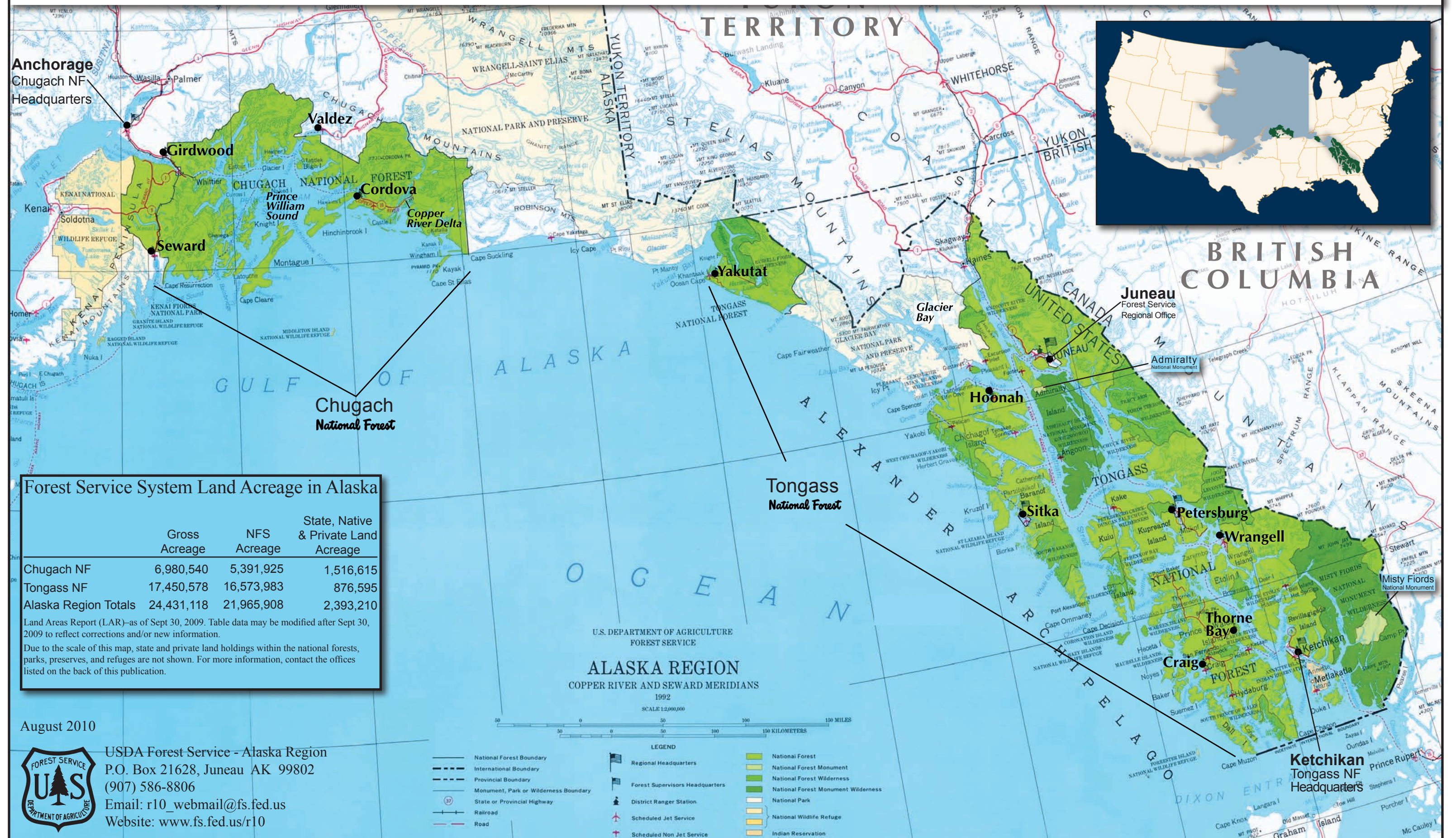
Forest Service System Land Acreage in Alaska